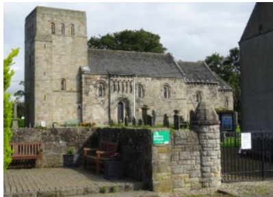
Romanesque 12 th century Church of Scotland