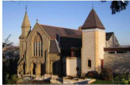
19 th century Church of Scotland. Displays and tours