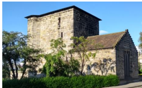
15 th century Scottish Episcopal Church. Displays and tours