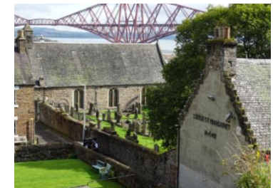
17 th century graveyard Many interesting graves Displays and tours ( please enter by the Masonic Lodge )