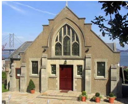
20 th century Catholic Church Displays and tours